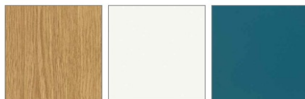
MFC: Oak, White and Petrol