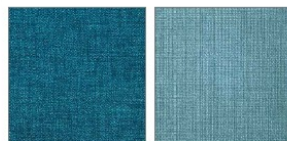
Fabric: Highland Teal & Highland Azura