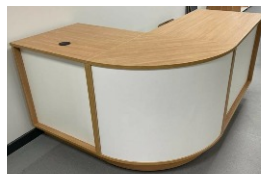
Sitting height counter unit, with acrylic front panel.

We are proud to have been part of this project and to have helped to create a space that will benefit the school's staff and students for many years to come.