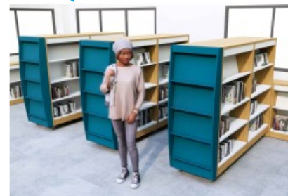
A mixture of single sided and double sided library shelving units to create a natural flow through the space. Pops of colour have been added to the wow end panels which add to the wow factor.